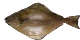
Greenland halibut - Reinhardtius hippoglossoides